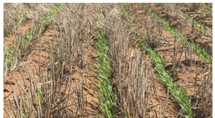
Paddock scale on-row seeding.