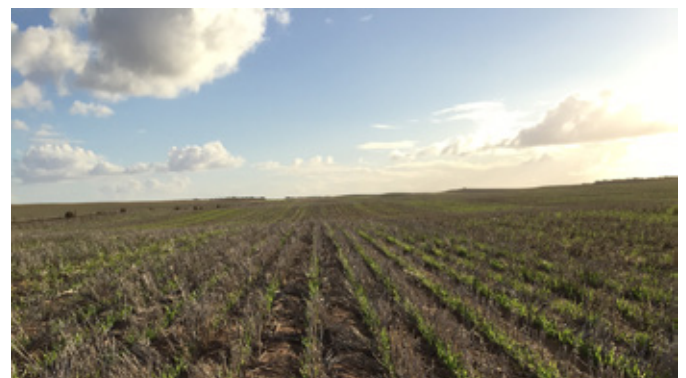
Paddock scale on-row seeding.

The ProTrakker demonstration site was show cased at the Mallee Sustainable Farming Field Day in September 2015.